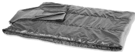
Padded roller sheet

Roller sheets come in several sizes and lengths. Short roller sheets are primarily used for pivoting and repositioning tasks such as sitting a patient up on the side of a bed or repositioning a patient up in bed. Long lateral roller sheets are intended for transferring supine patients from one surface to another such as from bed to stretcher.