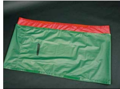
Flat roller sheets

Roller sheets are tubular sliding sheets constructed of specialized fabrics with low-friction inner surfaces that glide over each other. They look somewhat like a cross-section of a sleeping bag that is open at both ends. Roller sheets may be flat or padded and can be placed under draw sheets or incontinence pads.