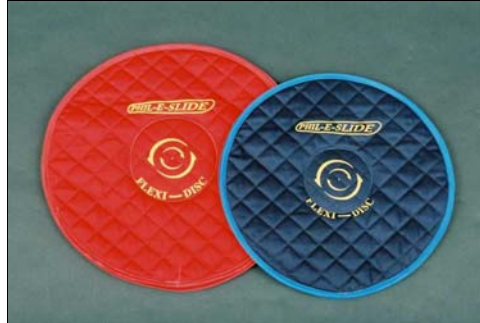
Flexible turning discs

Turning discs come in various sizes and may be flexible or solid. They consist of two circular discs that rotate against each other. The inner surfaces are made of low-friction material, while the outer surfaces are typically made of high-friction material. Turning discs are often used with transfer boards or transfer belts.