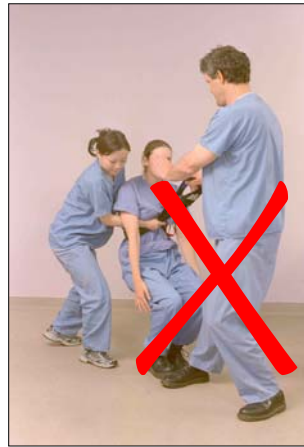
Do not use transfer belts to lift patients.