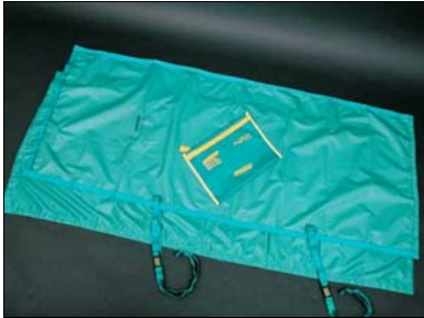
Set of two slide sheets

Slide sheets are constructed of low-friction fabrics or gel-filled plastics that enable a patient to slide over a surface instead of being dragged or lifted. Slide sheets come in various widths and lengths and may be used in pairs, singly, or folded. They may also be placed under draw sheets or incontinence pads. Some models have hand loops sewn into the fabric for caregivers to grasp. Longer slide sheets cover more of the contact area between the bed and the patient's body, but they also tend to be more difficult to remove.