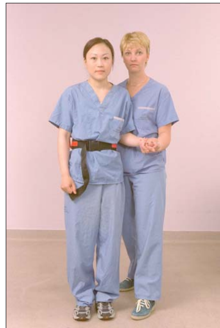
Transfer belts may be used for assisted walking.