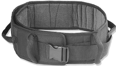
Padded transfer belt

Transfer belts come in a variety of sizes and shapes, fasten with a buckle, a clasp, or Velcro, and usually have handles to increase the caregiver's hand-placement options.