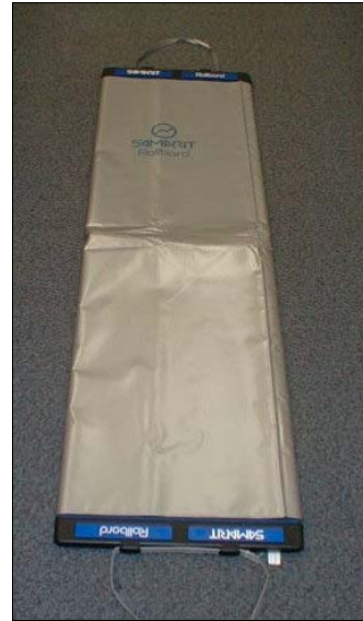
Rolling slide/transfer board

Caregivers either roll or slide patients onto the board. Some procedures involve pushing or pulling the board to accomplish the transfer. Others involve pushing the patient or pulling a draw sheet across the transfer board. Large patients and patients with sensitive skin may find them uncomfortable.