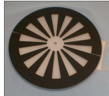
Solid turning disc

Solid turning discs are more durable and are used for pivoting patients who are weight bearing and can stand. Solid turning discs are usually made of wood or moulded plastic and may contain bearings. Patients who are weight bearing and can balance standing may be guided to a standing position and swiveled around without having to adjust their feet. Patients must have the strength to stand or this procedure will require the caregiver to exert excessive force in an awkward posture.