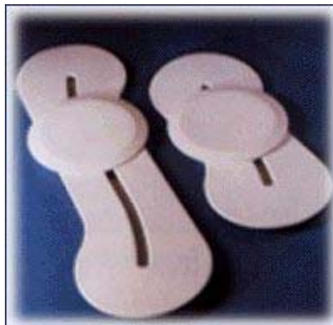
Smaller slide/transfer boards with moveable sliding sections