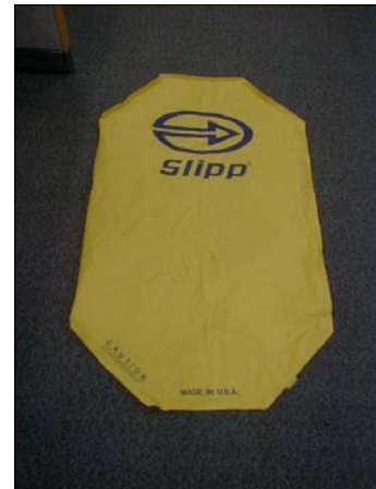
Gel-filled slide sheet