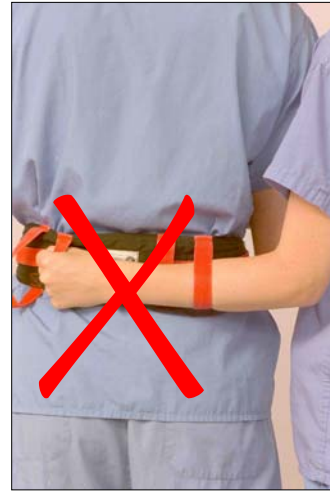
Never place your arm through transfer belt handles.