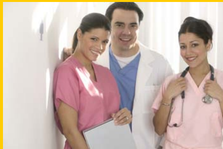
Employee Health & Safety Committee