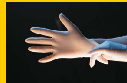
Listen to front line worker concerns and take action.